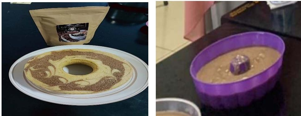
Gambar 2: Hasil Diversifikasi Konsentris Bolu Kopi dan Puding Kopi

The innovations produced in this study are in line with the theory of Tjiptono (2016) in the form of concentric diversification, where the new products introduced have a connection or relationship in terms of marketing and technology with existing products. In this case, innovation is taken from the same material but made with different variances.