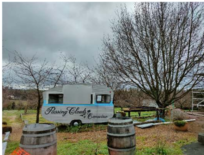
Figure 6. The Caravino

Caravino is a kind of picnic box that lies in the Passing Clouds winery area. Caravino is only open in certain seasons. Usually in Summer and Spring months. The Caravino is open Friday - Sunday with house made picnic boxes and take away bottles or glasses of wine available for purchase. The Caravino also the tourist can find a lovely shady spot to sit and enjoy the surroundings.