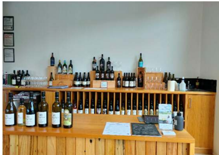
Figure 3. Wine Product

In addition to the above wine products, Passing Clouds also provides Gift Cards for gifts that are packaged in attractive forms.