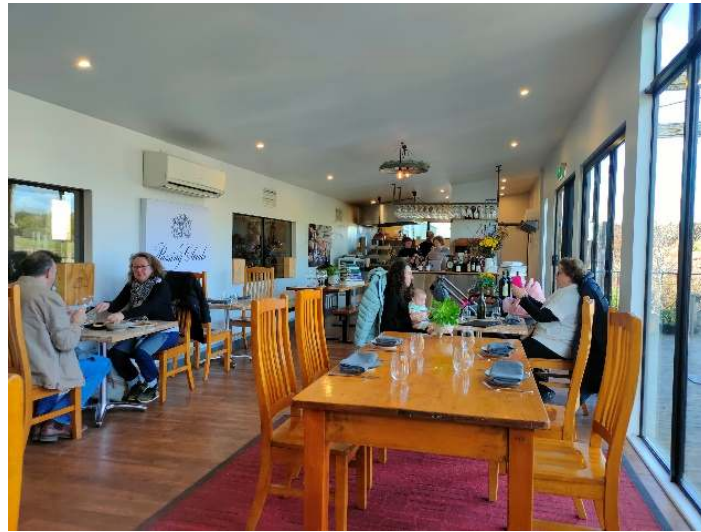
Figure 7. Fine Dining Ambience

The sensation that tourists can feel when Fine Dining is lunch with a view. Views of the expanse of vineyards, natural springs, wild birds and sheep eating grass. It's a beautiful atmosphere accompanied by delicious food that has been served by the chef.