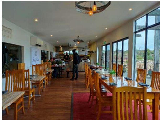
Figure 4. Dining Room

Passing Clouds, apart from producing wine, also consists of a dining room, Cellar Doors and The Caravino. The dining room is a place to eat, at least accompanied by special wines produced directly from Passing Clouds. The dining room only serves lunch and you must make a reservation in advance. The dining room is only open Thursday – Monday. The menu served for the Dining Room is in the form of Fine Dining and is always changing every week. The menu served varies from around the world. The menu served is complete, starting from Appetizer, Main course and Dessert.