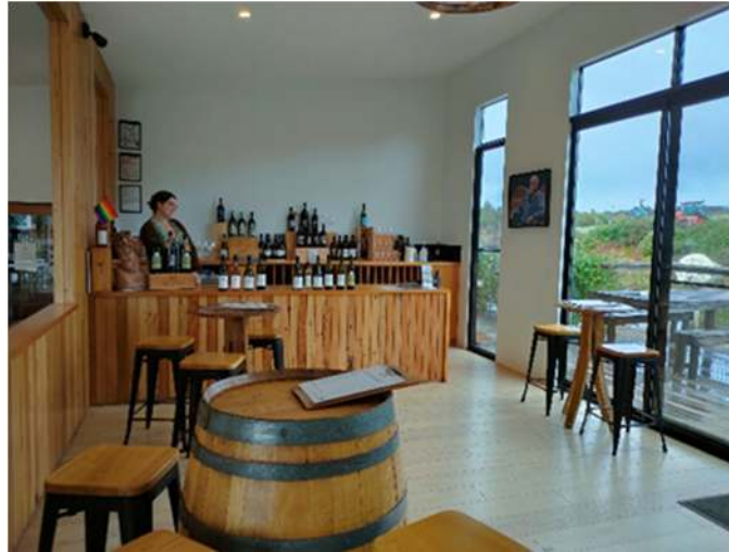
Figure 5. Cellar Doors

according to the type of wine being tried. Classic Wine Tasting $10 per person redeemable on purchase. Premium Wine tasting $15 per person not redeemable on purchase.