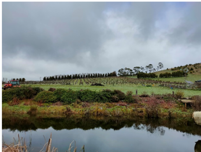
Figure 1. Passing Clouds Vinery Yard

They chose a location in a dry area in north west of Bendigo Victoria Australia. The location is used as a place to grow vines such as Shiraz and Cabernet Sauvignon for classic drink mixes. Then began to develop to plant grapes as the main ingredient for making wine. This is where the name Passing Clouds begins. Graeme Leith gave the name of the business that was started to be built with the name Passing Clouds. Bendigo is a barren area, so it rarely rains. As Graeme Leith surveyed his vine yard, large clouds just passed through the sky, with no rain at all. For this inspiration, Graeme Leith decided to name his business Passing Clouds. Then in 1998 Graeme Leith decided to move to Musk City and rebuild there. At Musk Graeme Leith developed less than 3 hectares of land for vine yards. In addition to building a location for processing grapes into wine. The types of grapes cultivated are Pinot Noir and Chardonnay Grapes.