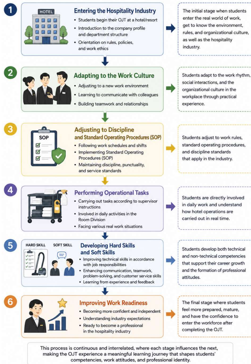
Figure 2. OJT Adaptation and Work Readiness Development Process Resource: Researchers, 2026

Figure 2 illustrates the process through which students adapted during their On-the-Job Training (OJT) in the hospitality industry and gradually developed work readiness. The process began when students entered the industry environment and became familiar with organizational culture, workplace structures, and the various rules and expectations governing professional practice. At this initial stage, students encountered an environment that differed significantly from their academic setting, requiring a substantial period of adjustment and adaptation.