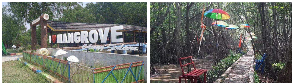
Figure 3. Mangrove Forest in Sedari Village