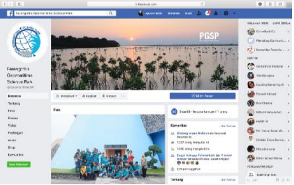
Figure 8. Facebook Parangtritis Geomaritime Science Park (PGSP)

Despite of the weakness, the Facebok shown a very good update as the content always renew in two or three days apart. Unlike Sonobudoyo and MPI UNY, this Facebook already has its