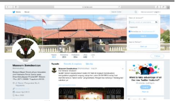
Figure 3. TwitterSonobudoyo

Compare to the other 2 museums in the study, the museum has a more advance technique in uploading the content in the social media such as shown in their Instagram that is already clustered with a good designed 'Highlight' underneath the bio so people could find out museum activity and promotion more easily without scrolling to bottom. In terms of timing, the Instagram in Figure 2 showed it has 2772 followers and already included some momentum event such as the greeting for Indonesian Independence Day.