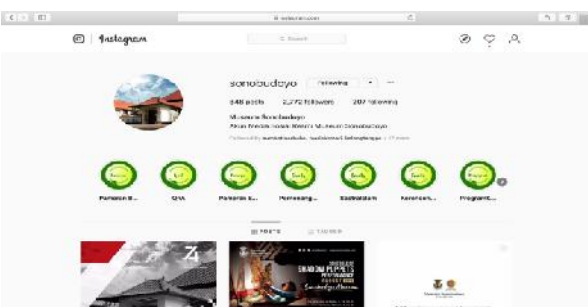
Figure 2. InstagramSonobudoyo

Compare to the other 2 museums in the study, the museum has a more advance technique in uploading the content in the social media such as shown in their Instagram that is already clustered with a good designed 'Highlight' underneath the bio so people could find out museum activity and promotion more easily without scrolling to bottom. In terms of timing, the Instagram in Figure 2 showed it has 2772 followers and already included some momentum event such as the greeting for Indonesian Independence Day.