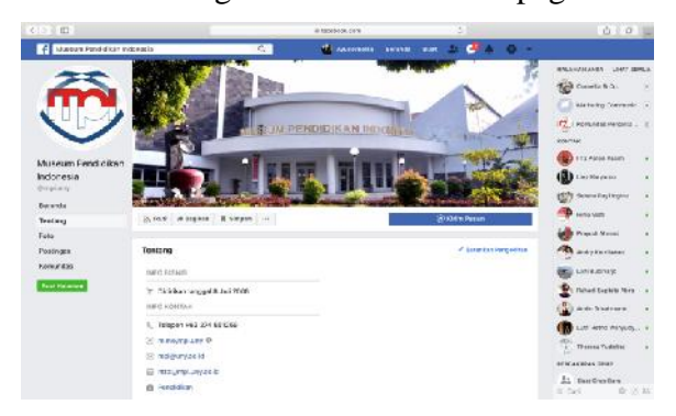
Figure 4. Facebook Museum PendidikanIndonesia UNY

Sonobudoyo Museum, there is no original English translation and only depends on automatic Google translation for the page.