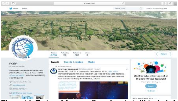
Figure 10. Twitter Museum Gumukpasir (still included in ParangtritisGeomaritime Science Park)

Similar to the Facebook, the account name of Gumuk Pasir museum is still included in Parangtritis Geomaritime Science Park. It has 2,042 followers with very good content update period as the last update is on the 28<sup>th</sup> of August 2019. There has been quite variety activity uploaded such as Sand Dunes Geospatial Run which will be held on the 27<sup>th</sup> of October 2019 and Batik design competition in September 2019. In addition, the museum also upload useful content for communities in Yogyakarta such as Jogja Air Show which was held on Sunday the 25<sup>th</sup> of August 2019 in Depok beach nearby Parangtritis Geomaritime Science Park and the museum.