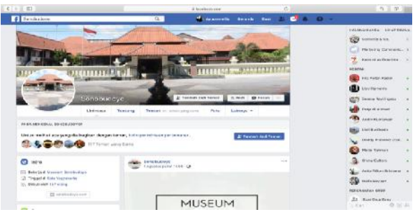
Figure 1. Facebook Sonobudoyo

Sonobudoyo Museum promotes its activity through social media quite consistent that is through Facebook Sonobudoyo (Figure 1), Instagram Sonobudoyo (Figure 2) and Twitter @sonobudoyo as shown in Figure 3. The Facebook has 3416 followers with last update is on the 1<sup>st</sup> of August 2019 which is quite long vacuum for uploading the content. There is no English language available which will find difficulty for foreign tourist to understand the information.