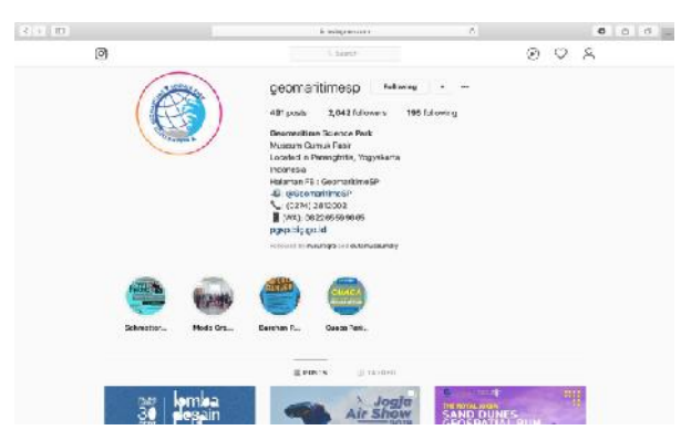
Figure 9. Instagram Museum Gumuk Pasir (still included in Parangtritis Geomaritime Science Park account).

own translation facilities in the page (not in Google). 1.240 people follow and has 1.227 people likes the Facebook. This is showed a good engagement between museum management and the people who follow and like.