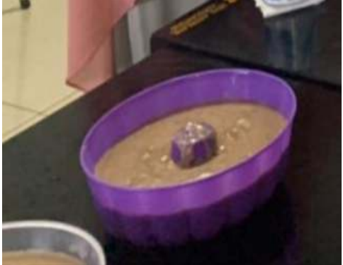
Gambar 2: Hasil Diversifikasi Konsentris Bolu Kopi dan Puding Kopi