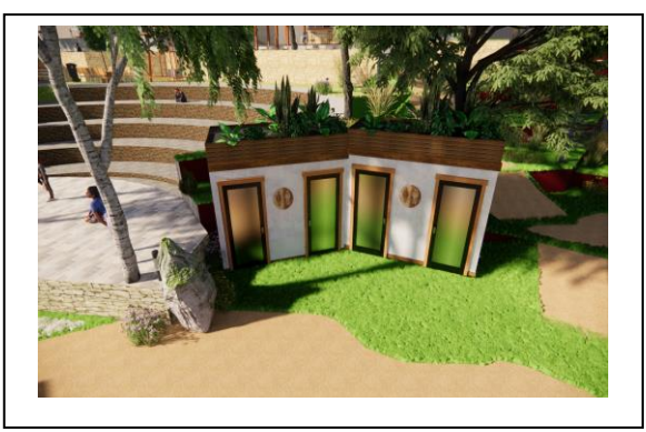
Figure 11. Bathroom