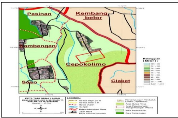
Figure 4. Land Use Map of Cepokolimo Village