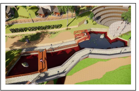
Figure 15. Fish Pond