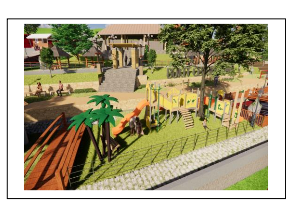
Figure 17. Children's Playground