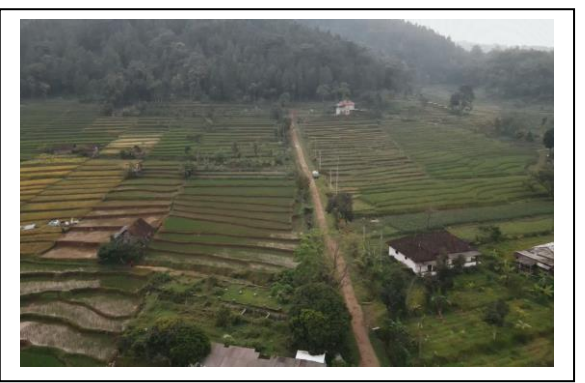
Figure 1. Location Planning Kembang Belor Cepokolimo Ciaket Claket FROM

Based on the topographical conditions of the area, the western part of Cepokolimo Village, which is a pine forest hill area with an altitude of \pm 750 m above sea level with a geographical location of 7^{\circ}39'36'' LS and 112^{\circ}33'18'' BT, is very suitable to be used as a campsite and lodging place because it is in a highland area so as to expand the visibility of the beautiful view around Cepokolimo Village and not close to urban areas or residential areas ( \pm 250 m from settlements. An overview of the planning location along with a map of its topographical condition is presented in Figure 1. and Figure 2.