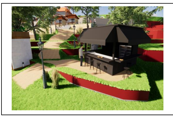
Figure 13. Restaurant