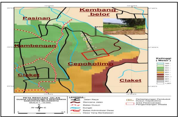
Figure 5. Cepokolimo Village RoadMap

Village - Cepokolimo Village. The width of the road in the village is 2 - 3 m with a layer of pavement from concrete and not hollow. This road is a two-way road that is only enough for one lane of 4-wheeled vehicles so that there is potential for congestion. Strategies that can be used in the development of tourism villages include improving accessibility, developing various infrastructures to support tourism, involving the community in every stage of development (Sumantri, 2018). construction of this alternative road is to the east of the Cepokolimo Village area. An alternative roadmap in Cepokolimo Village is presented in Figure 5.