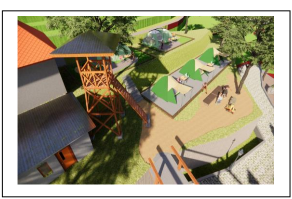
Figure 12. Camping And Prayer Room Areas