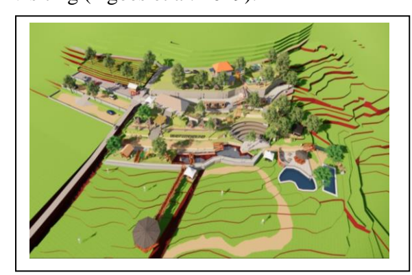
Figure 6. Overview of the Cepokolimo Village Tourist Destination Plan Drawings

The design of tourist destinations in Cepokolimo Village is made with the concept of developing ecotourism that minimizes conponded buildings to keep the environment natural. The land used in the tourism planning plan in Cepokolimo Village is an area of 8320 m2. Because it uses the concept of ecotourism, of the 8320 m2, most of it is a rice field area. Illustration of tourism planning and development in Cepokolimo Village is presented in figure 6. Designing the right travel program is essential to keep tourists visiting (Agoes et al. 2019).