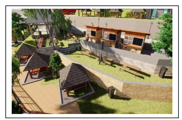
Figure 9. Gazebos and Food Stands