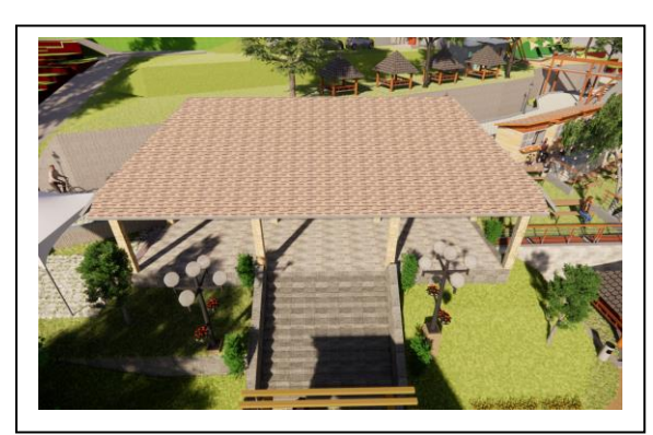
Figure 10. Caffe and Souvenir Shop