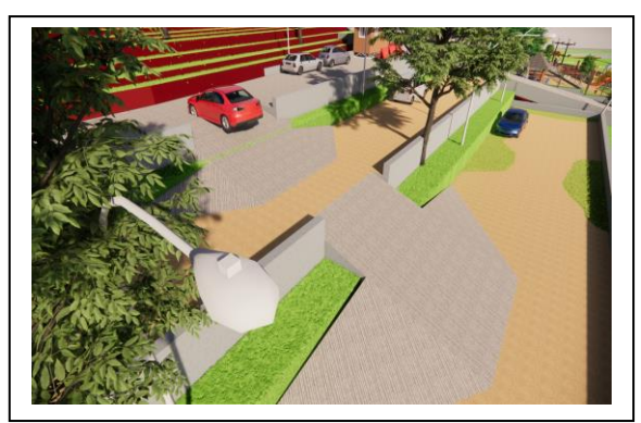
Figure 7. Parking Lot

1) Parking lot, guard post and entrance. The planned parking lot has an area of 900 m2 (Figure 7.)