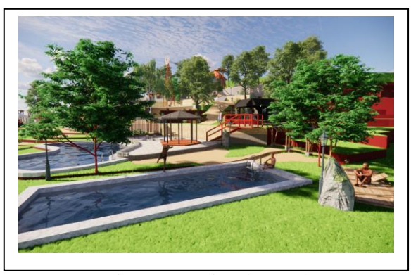
Figure 16. Swimming pool