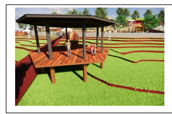
Figure 18. Viewpoint