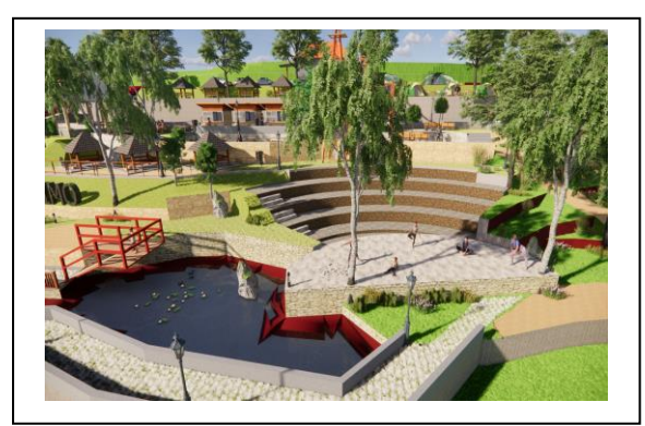
Figure 14. Theater